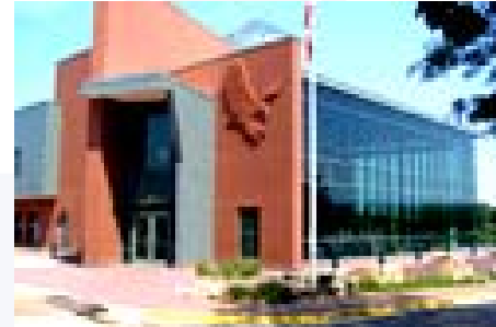
National Eagle Center - Wabasha