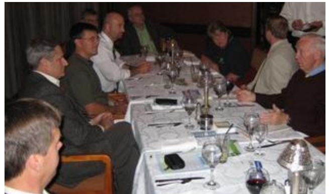
Congressman Jim Oberstar meeting with TH 15 Steering Committee members on November 1.